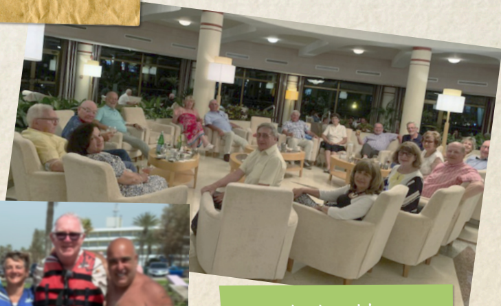
...in the hotel lounge Cyprus