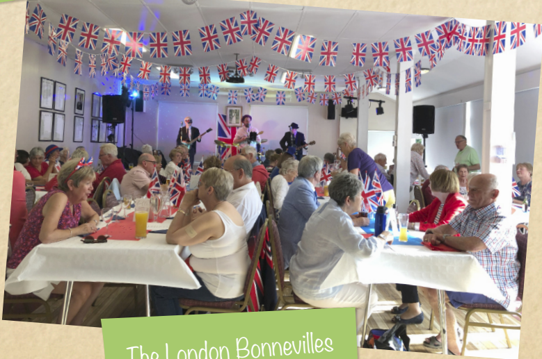
The London Bonneville's at the Jubilee barbecue